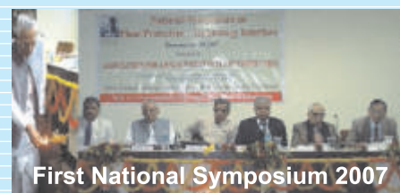
First National Symposium 2007

change, Plant Protection and Food Security Interface', during Dec, 17-19, 2009. The Third Symposium, International, a sequel to the first two, entitled Food Security Dilemma: Plant Health and Climate Change Issues' is proposed during Dec, 7-9, 2012.